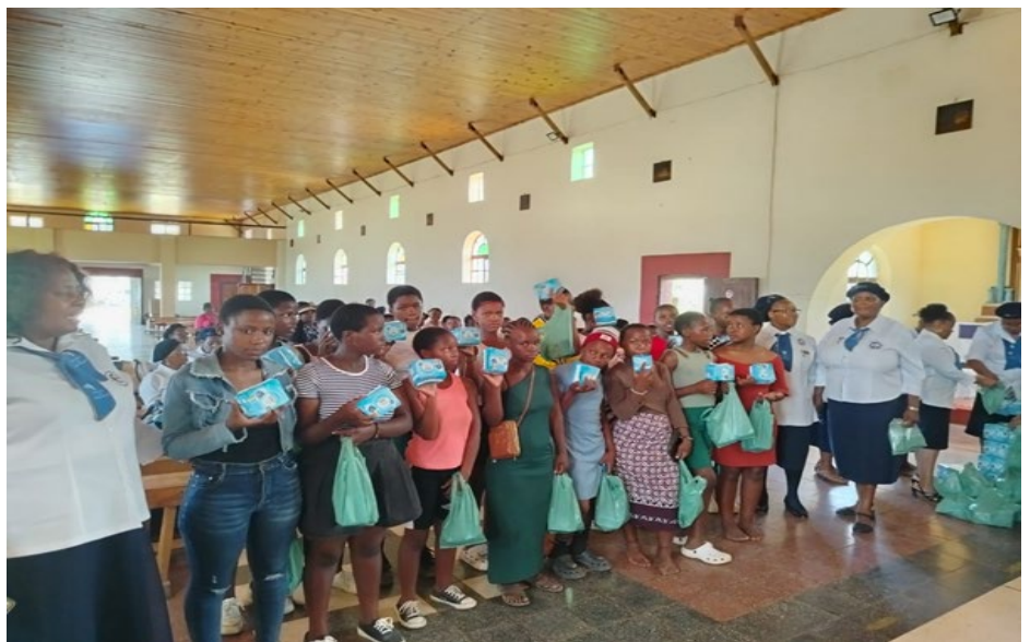
The Catholic Nurses Guild of South Africa Team on their arrival for the Hygiene Project in Mowbary Primary School

CNG SA extended the Menstrual Hygiene project to another rural area on the 21/03/2025 and visited St Cecilia Parish Community in Umzimkhulu. Health talk was presented to young girls and young women. Donations of old clothing to the disadvantage as Corporal works of Mercy to cloth the naked was conducted.