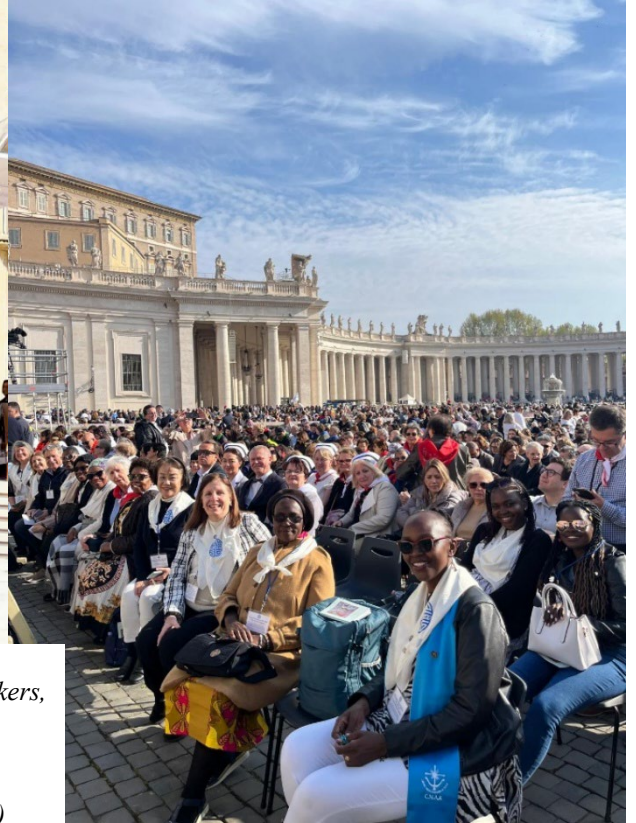
His Holiness Pope Francis blessing the faithful assembled at the Holy Sacrifice of the Mass for the Jubilee for the Sick and Healthcare Workers, April 6, 2025, St. Peter's Square

CICIAMS Executive Board members front row followed by members of Catholic Association of Polish Nurses and Midwives / Katolickie Stowarzyszenie Pielęgniarek i Położnych Polskich (KSPiPP) and healthcare workers from around the world