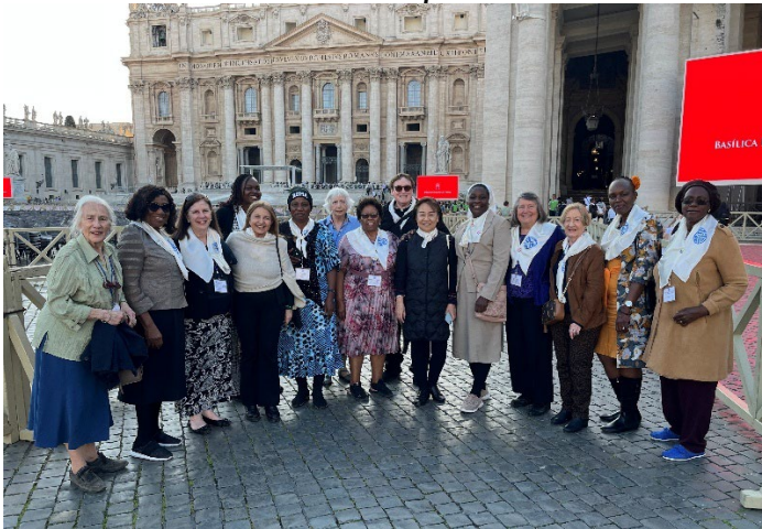
CICIAMS Executive Board enroute to the Holy Door of St. Peter's Basilica, Jubilee for the Sick and Healthcare Workers, Vatican City, April 3, 2025 / Holy Doors ▼