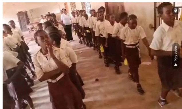
Distribution of pad to Senior Secondary Students