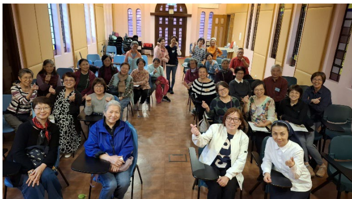
Fig.1 Members and their friends who participated in the retreat