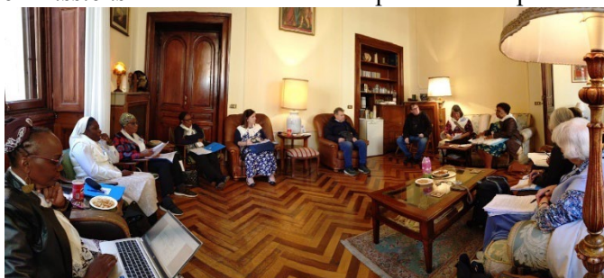
CICIAMS Executive Board Meeting-Day 2 at Maryknoll House