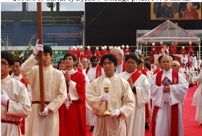
This is a celebration of the benedictions of 188 Japanese martyrs, held at Nagasaki Prefectural Baseball Stadium in 2008. Among them were Japanese members of the Augustinian Order, so Pope Leo XIV attended as the Superior General of the Augustinian Order. I was also at the venue. I am deeply moved.

← Pictures provided by nurses from each country.