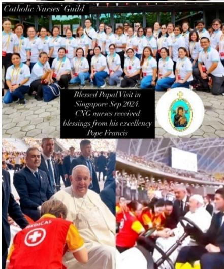
Catholic Nurses' Guild (CNG)-Singapore members volunteered as first aiders during the Holy Father Pope Francis' visit to Singapore in September 2024

International Catholic Committee of Nurses and Medical Social Assistants, CICIAMS Secretariat, Palazzo San Calisto 16, Vatican City 00120 www.cicams.org 21 April 2025, cicamsit@emil.com / 2025@emil.com