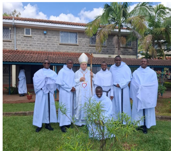
The future Pope Leo XIV, visiting the Augustinian Community in Karen (Langata South Road), near Tangaza University–CUEA. It is a small world