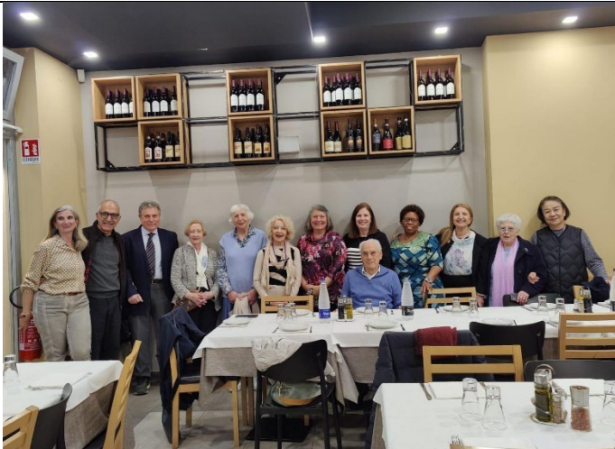
Dinner with colleagues from the