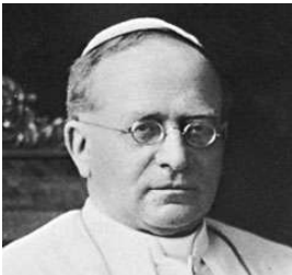
His Holiness Pope Pius XI 1922-1939

DONATIONS for the PERIOD FRIENDLY WORLD / MENSTRUAL HYGIENE PROJECT can be wired to CICIAMS at the IOR/Vatican Bank – http://www.ciciams.org/donatetoCICIAMS.html Contact the Secretary General for questions: CICIAMSInternational12@gmail.com